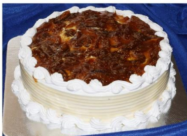
FIG & HONEY Rate : 1 kg 1100/-, half kg 700 /-