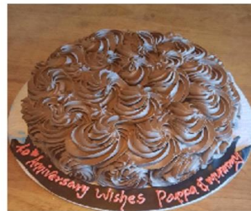
ELYSSE ROSE (RICH CHOCOLATE FUDGE WITH FRENCH COFFEE) Rate : 1 kg 1100/-