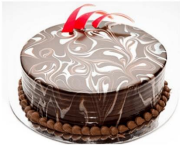
DARK VANCHO Rate : 1 kg 850/-half 500/-