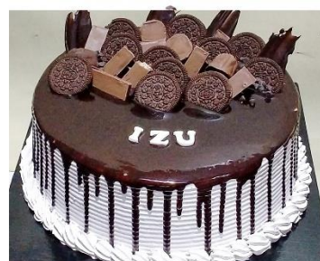
OREO CANDY Rate : 1 kg 1100 /-, half kg 700 /-