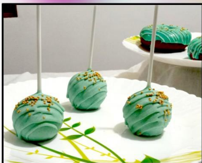
Cake pops per.pc 60/-