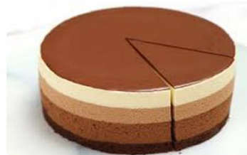
TRIPLE CHOCO CHEESE CAKE