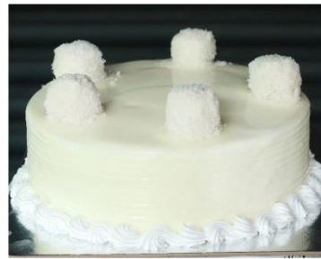
MILKY TRUFLE Rate : 1 kg 900 /-, half 550 /-