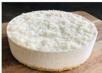
TENDER COCONUT MOUSSES CAKE