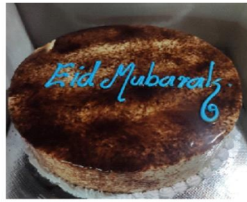
IRISH COFFE (LIGHT COFFEE FLAVOUR) Rate : 1 kg 850 /- half 600 /-