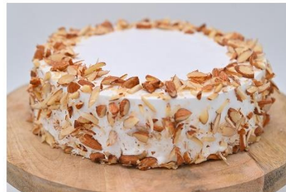
ALMOND GATEAUX Rate : 1 kg 1400 /-