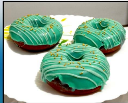
Dounuts per. pc. 60 /-