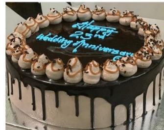
CARAMAL CHOCOLATE Rate : 1 kg 900/-