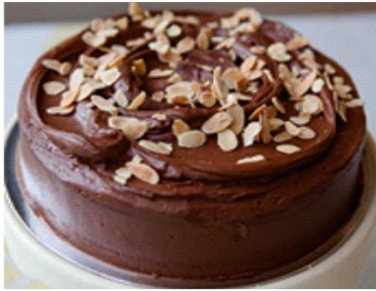
VENUS DEVILS (RICH CHOCOLATE & NUTS) Rate : 1 kg 1200/-