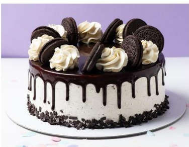
OREO CAKE Rate : 1 kg 950 /-, half kg 650 /-