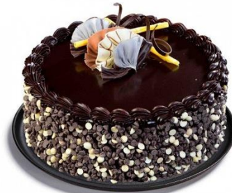
CHOCOCHIP CHIP CAKE Rate : 1 kg1150/-