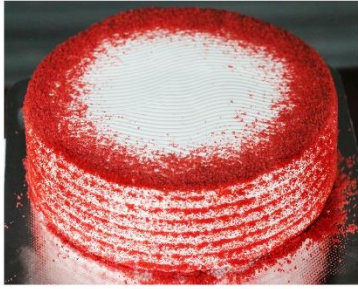
RED VELVET Rate : 1 kg 850/-