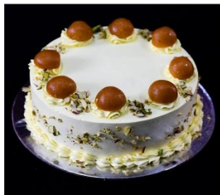
GULAB JAMON CAKE Rate : 1 kg1200 /-