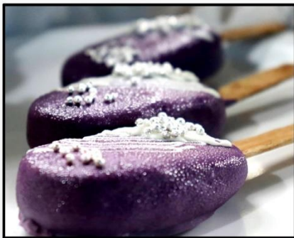
Sickles per. pc.120/-