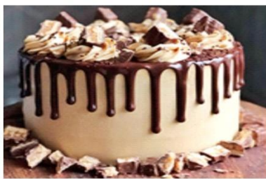
TOFFE CANDY CAKE Rate : 1 kg 1150 /-