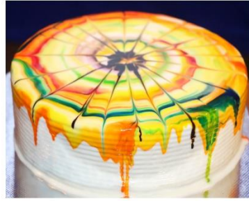
RAINBOW Rate:1kg 950/-