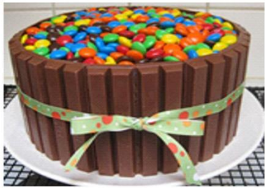
KIT KAT CAKE Rate : 1 kg 1400/-