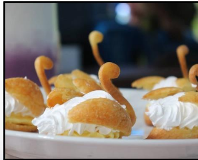
Swan's please ask