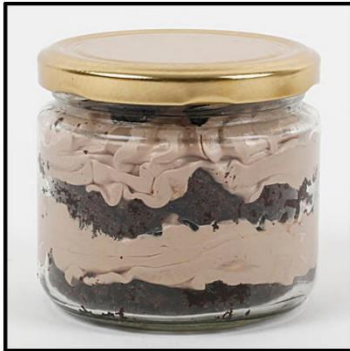
Jar cake per. pc 140/-