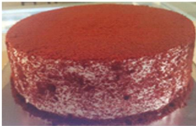
CHOCO VELVET Rate : 1 kg 900 /-