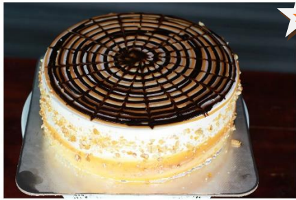
BUTTERSCOTCH premium Rate : 1 kg 750 /-, half 400 /-