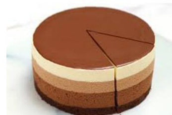
TRIPLE CHOCOLATE MOUSSE