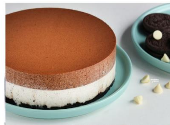
OREO CHOCOLATE MOUSSE