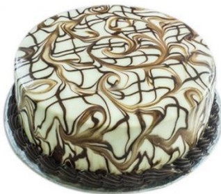
WHITE VANCHO Rate : 1 kg 850/-half 500/-