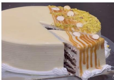
SPANISH DELIGHT Rate : 1kg 1100/-