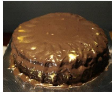
DEVILS CHOCOLATE Rate : 1 kg 999/-