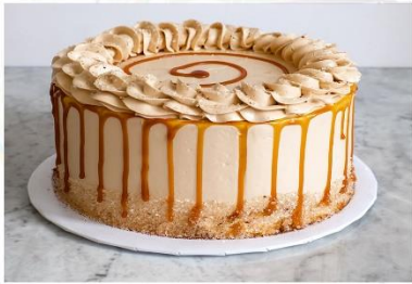
DULCE DE LECHE