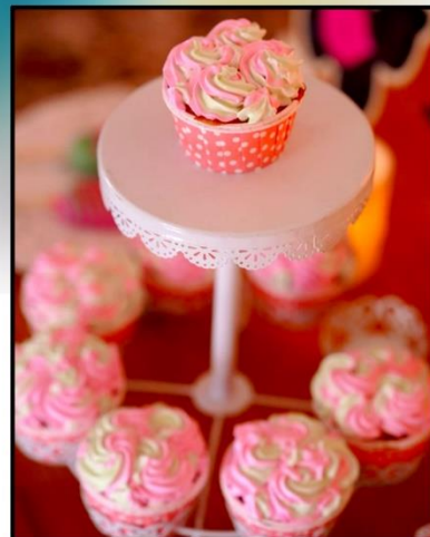
Cup cake per.pc 40/-