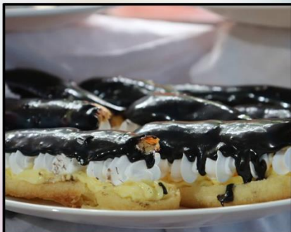
Eclair please ask