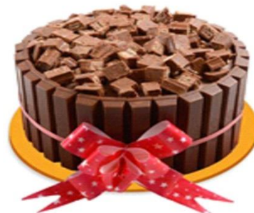
KITKAT & CHOCOLATE CANDY Rate : 1 kg 1400/-